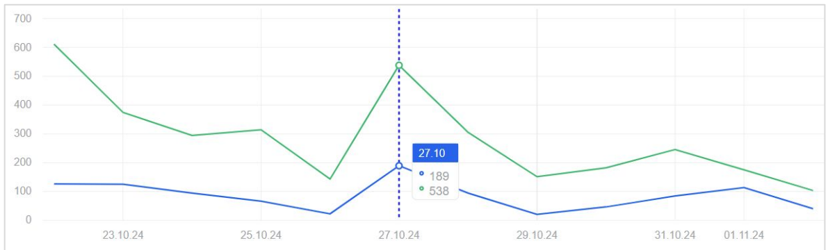
Figure 3. Number of Telegram publications about candidates Sandu and Stoyanoglo.

The active involvement of Russian propaganda and clear attempts to influence the presidential elections in Moldova indicate the significant attention Russia pays to efforts aimed at changing this country's geopolitical course. The share of propaganda and compromised sources involved in these actions sometimes doubles the average figures of other information campaigns and influence operations.